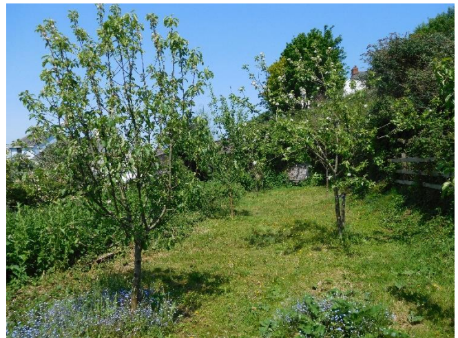
Community Orchard on the Tarka Trail